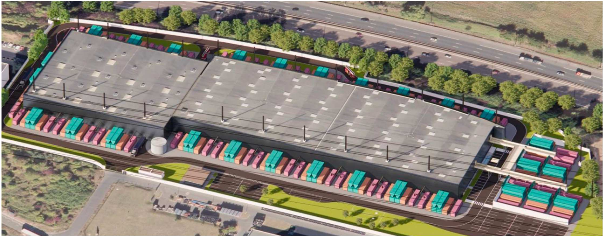
PAR6 St-Ouen L'Aumône – HDD illustration.